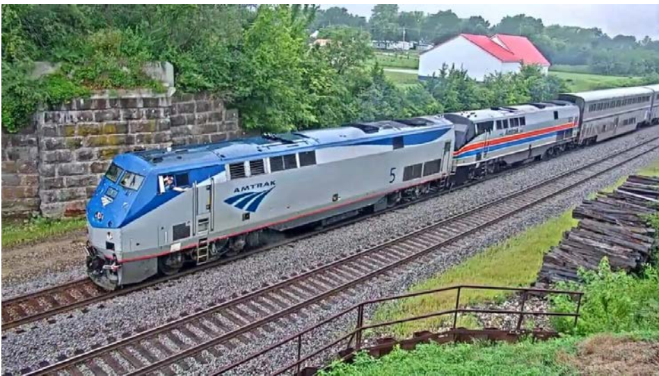
AMTK 5 with a conductor waving as he leads the Amtrak Southwest Chief, with a phase 2 heritage 130 trailing, bound for Chicago through La Plata.