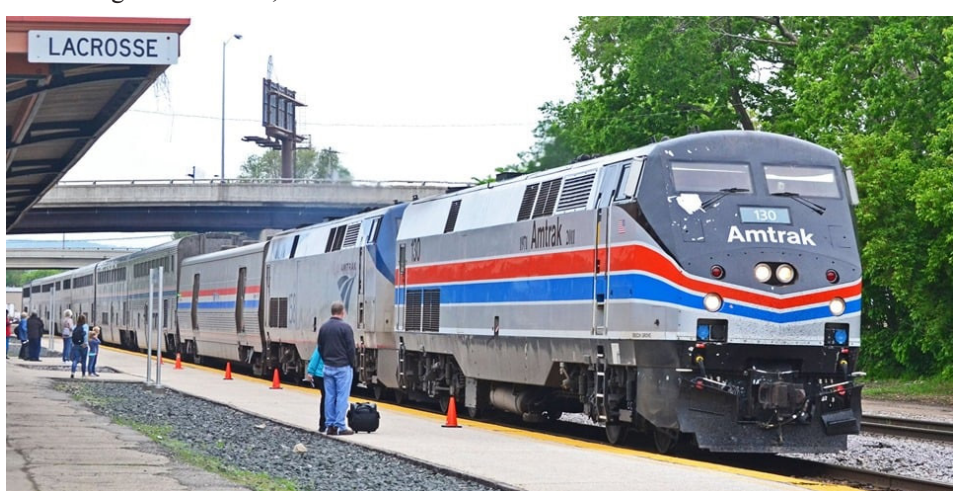
AMTRAK Empire Builder train 8-28 making a scheduled stop at Lacrosse, WI