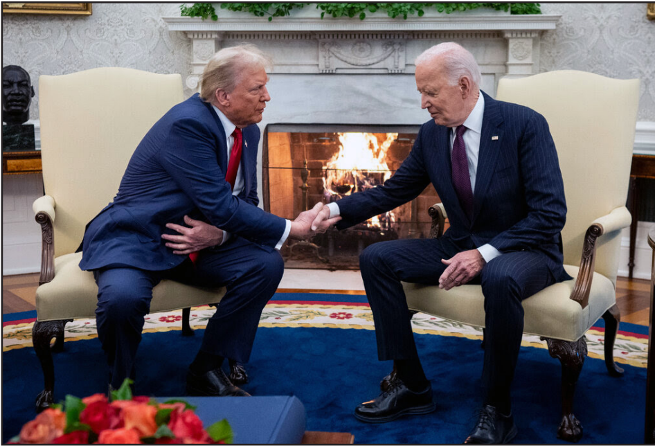
Returning to Washington, Trump Meets With Biden and visits House Republicans.