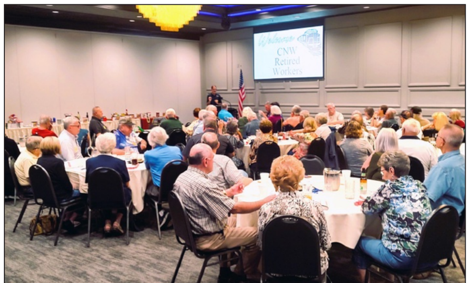
NARVRE and Jones & Granger Informational Meeting in Green Bay WI.