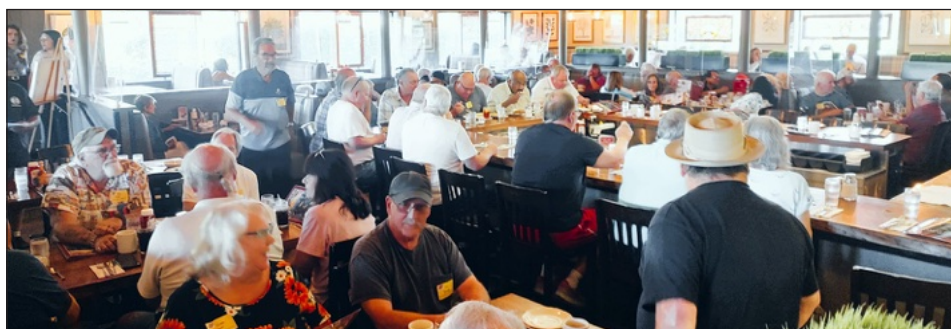
NARVRE and Jones & Granger Informational meeting with CNW retirees in Chicago IL.