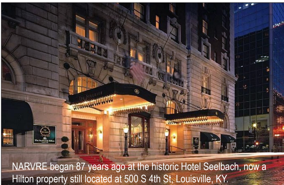
NARVRE began 87 years ago at the historic Hotel Seelbach, now a Hilton property still located at 500 S 4th St, Louisville, KY.