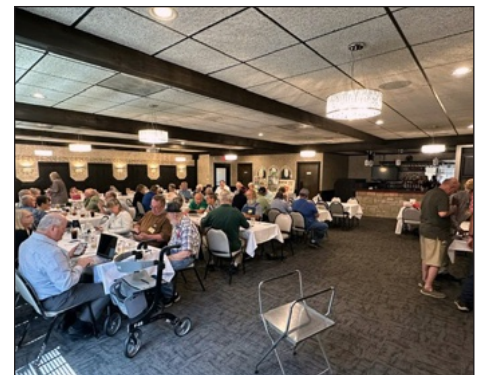
CNW Meeting, Madison, WI, August 23, 2024.