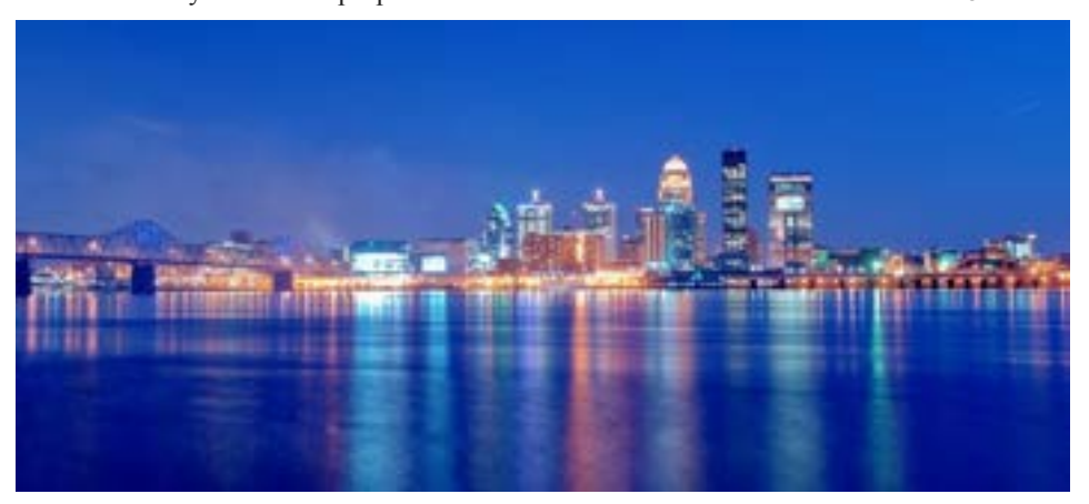
NARVRE INC. Where it all began Labor Day, 1937, in Louisville, Kentucky.