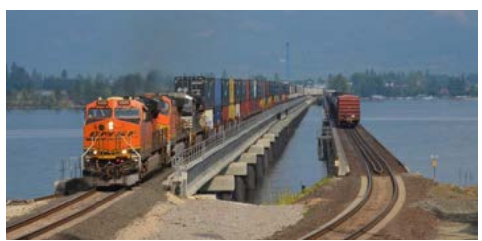
Old and New bridges. Lake Pend Oreille, ID, east of Spokane, WA.