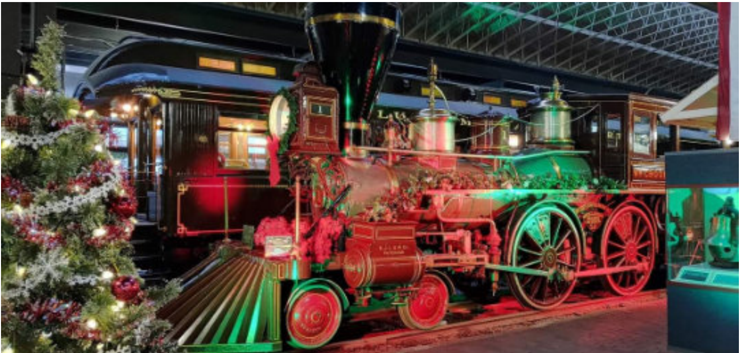
North Pole Express at St Paul Depot is Running again this December - The Friends of the 261 train organization in the Twin Cities MN. This locomotive is on the other end of train pictured on the front page.