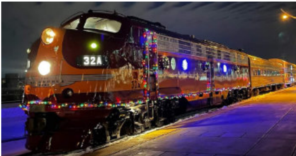
The North Pole Express at St Paul Depot is running again this December. Brought to you by The Friends of the 261 - train organization in the Twin Cities MN