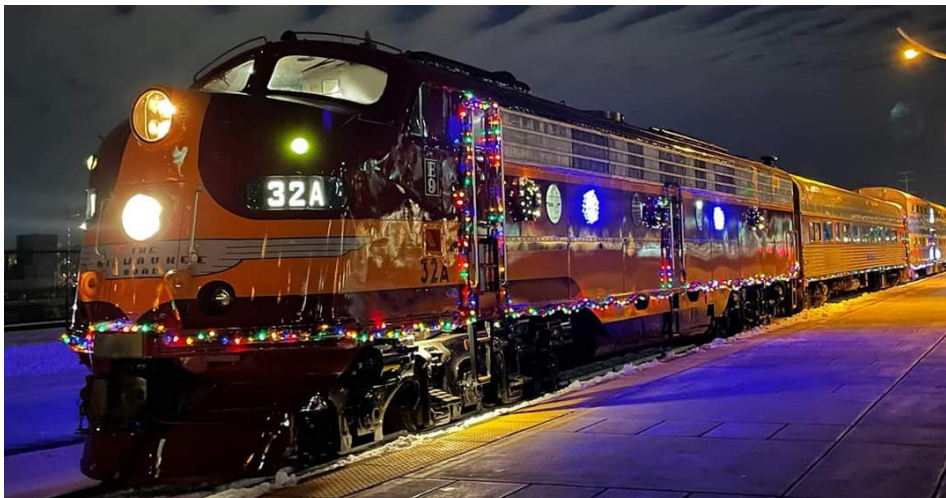
The North Pole Express at St Paul Depot is running again this December. Brought to you by The Friends of the 261 - train organization in the Twin Cities MN