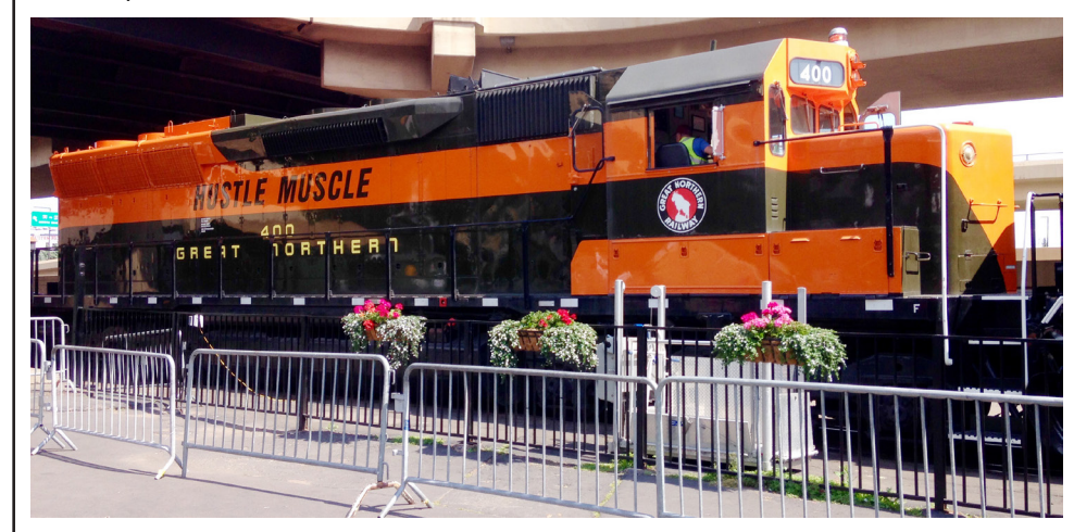
Specially refurbished locomotive GN 400 (Hustle Muscle) powered the train ride.